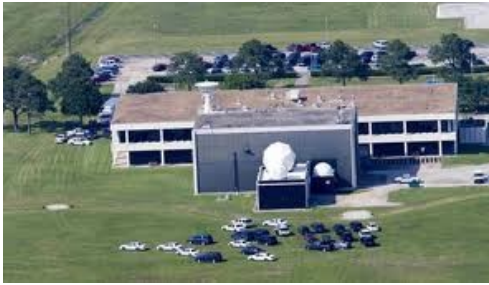
Johnson Space Center, Building #44